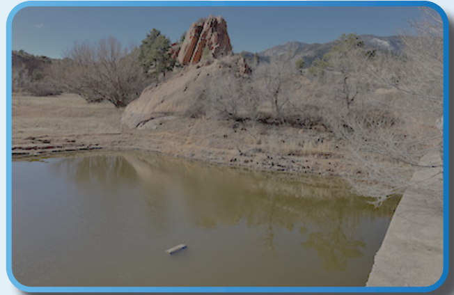
The pond from years ago vs. the pond of today