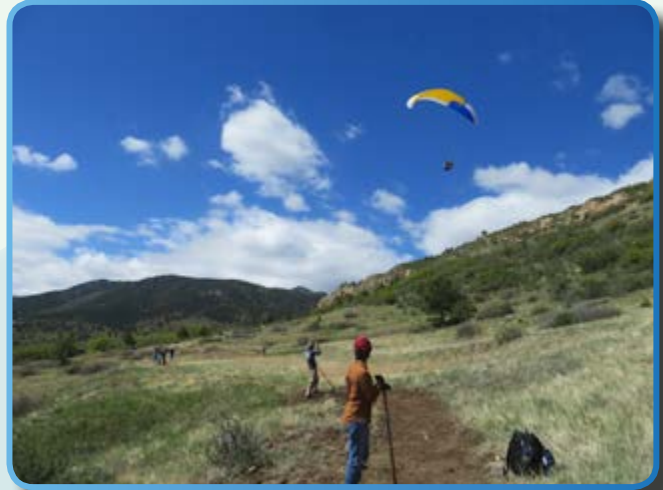
Ted paraglides into Colorado Public Lands Day, 2017

This was a great day for people to connect with nature, challenge themselves, and to get closer to people and give back to the public lands we all love so much.