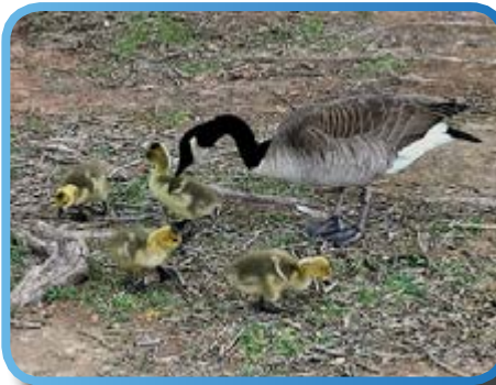
See these babies right now at the pond!

Let's all join in this year and every year to be the best stewards of these amazing places we all cherish and love so much.